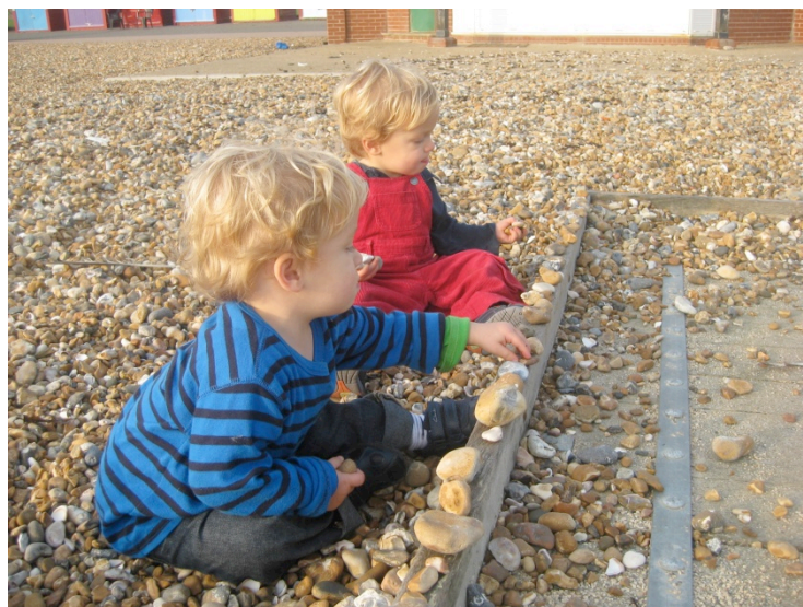
Sequencing stones at the beach

Banging rhythmically, placing systematically and following a pattern of movement indicates early Sequencing . Although the photo below is not of a Treasure Basket, the treasures of the beach give the boys a fantastic opportunity to practice their early Sequencing !