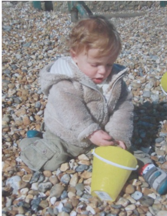
Picking up and Placing

Young children learn by doing things. But what happens when they don't just get on with it, when they don't move about and explore very much? The Waldon Approach/Functional Learning addresses the problems of these children. It's all about helping children to develop their Learning to Learn Tools. It's also a family approach, supporting the everyday life of all the family. Parents feel empowered and realise they can make a difference in their children's lives. They begin to look at play and learning with different eyes. They see that the intensive work done in the Functional Learning Lessons supports their child's learning in other settings, at home, in the garden, at the park, at the shops. All that focused unscrewing and screwing of glass jar lids suddenly translates to their little one being able to open doors at home - independently.